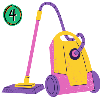
The vacc 🧡 m cleane 🧸