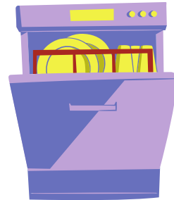
The dishwashe 🌸