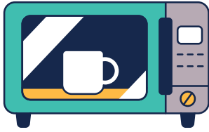
The microwav 🌸